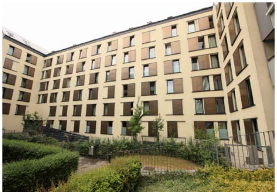
Supplying with district heating what the building cannot generate by itself is especially good in blocks of flats build as passive houses.