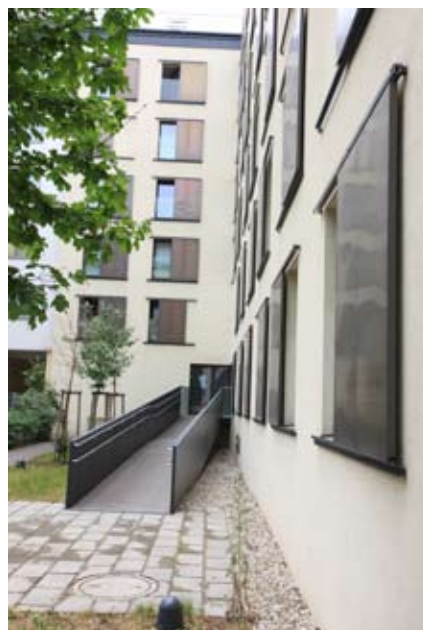
The old listed houses in Vienna are difficult to turn into low energy houses. Therefore it is even more important that we focus on building new houses according to low energy concepts, Günther Lang from IG Passivhaus says.